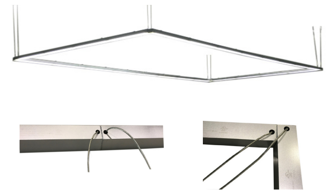
Multiple fixtures can be connected as shown above

0-10V DIMMING | SMART LIGHTING COMPATIBLE | EXTERNAL DRIVER